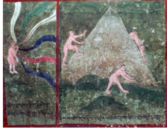
Fig. 14. Signs for places where the deceased is to take rebirth: lights of the six realms, and feeling of going up, sliding down or walking flat.

After all those terrifying appearances, the deceased will now want to find a place to take rebirth.