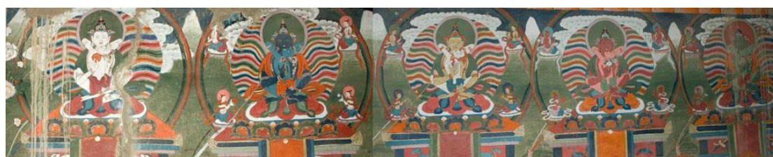
Fig. 3: Main Peaceful Deities: the Tathagatas Vairocana, Akshobhya-Vajrasattva, Ratnasambhava, Amitayus, Amoghasiddhi.

But this recognition is quite difficult; so, after the moment of clear light experience has passed, if it has not been recognized the deceased falls unconscious for three and a half days. When he regains consciousness he will have to continue and roam in the intermediate state of ultimate reality passing through a series of visual and auditory experiences. In a first phase he will be confronted with peaceful deities: day after day he will meet one of the five peaceful Tathagatas in sexual union with his consort. From the heart of each Tathagata a ray of pure, brilliant, dazzling primordial wisdom-light will reach the heart of the deceased, together with a ray of dull light from one of the six realms. In fact below each of the peaceful and wrathful deities on our mural there is the image of a deceased person confronted with two rays of light, one emanating from the heart of the deity, and the other from one of the six realms.