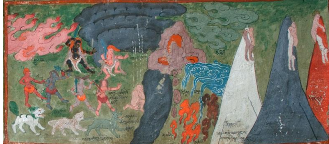
Fig. 12. First image of srid pa bar do . The inscriptions read: ‘Many particular appearances arise: fierce winds, karmic flesh-eaters and cannibals brandishing many weapons, being followed by wild beast from the back, a very thick darkness in the front, hail storms, mountains collapsing, floods, blizzards, fire spreading, great winds, falling from a white, a black and a red mountain (Appendix, inscription 6).

However, if one is swept away by one's own fearful visions and does not recognize them as aspects of one's own mind, one will have to proceed to the third phase, the intermediate state of becoming. One will have experiences such as being persecuted by the demons of one's own karma, being pushed into a snowstorm or into pitch dark, and one's sole desire will be to flee.