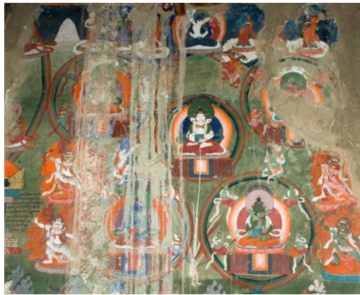
Fig. 6. On the sixth day of the chos nyid bar do the five peaceful Buddhas appear together, each with his consort. On top: Kuntuzangpo with Kuntuzangmo and the Buddhas of the six realms; around: four female and four male gatekeepers.

The inscriptions afford the name of each pure land and of the corresponding Buddha, together with the name of the particular wisdom aspect generating from his heart and the colour of the light of the particular realm of conditioned existence associated with it. In the Bar do thos grol text the spiritual guide will read out the characteristics of each deity and encourage the deceased to recognize the vision as an aspect of his own nature. Instead of fleeing from it, he should unite with the light, thus obtaining liberation. If he instead follows the softer and less fearful light of one of the six existences simultaneously manifesting with each of the Peaceful Buddhas, he will end up reincarnating in one of the six conditioned worlds of existence.