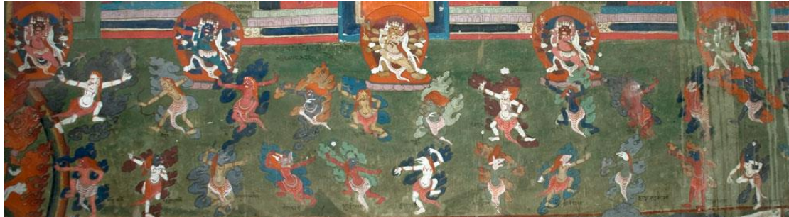
Fig. 9. The assembly of the fifty-eight wrathful deities with their entourage.

text. 16 In the Bar do thos grol text the visions experienced by the deceased are described as dreadful: very bright lights, very intense rays of light, and violent sounds. But the person guiding him will explain all details of these visions and will encourage the deceased not to be afraid and to become one with the deities. If he recognizes all those appearances as manifestations of his own mind, he will be liberated.