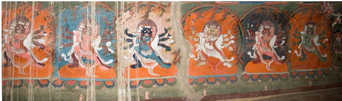
Fig.8. Main wrathful deities: Mahottara Heruka, Buddha Heruka, Vajra Heruka, Ratna Heruka, Padma Heruka and Karma Heruka, each with his consort.

After the visions of these peaceful deities, there follows a series of more terrifying experiences of wrathful deities. On the mural we now have to go to the second row of paintings, starting from the viewer’s left.