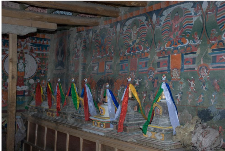
Fig.1. Overview of the mural painting.

Structurally, the wall painting is divided in two rows: the upper row, starting with the image of Küntuzangpo, shows all the peaceful deities, first one by one, then all together, and finally the five Vidyadharas with their entourage.