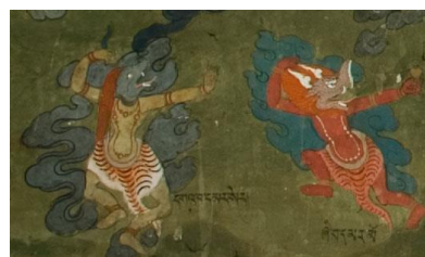
Figs. 10 and 11. Detail of 2 Keurima deities: Tseuri (Tse'u ri) and Tramo Marmo (Pra mo dmar mo); Figure 11: two Ishvari deities, yoginis of the southern direction: Gawa Marser (dGa' ba dmar gser) and Zhiwa Marmo (Zhi ba dmar mo).