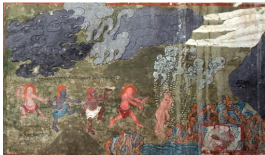
Fig. 15. Appearances arise such as whirlwinds, blizzards, hailstorms, darkness (Appendix, inscription 8). In the right corner below a couple is making love and that is where the deceased is tempted to flee (I have not been able to decipher the inscription below the couple).

Lights from the six samsaric realms will manifest, the brightest one indicating in which realm the karma of the deceased will lead him to reincarnate, and he will have the impression that he has to ascend a mountain (in which case he will take birth in the higher realms) or to descend (in case of rebirth in the lower realms) or else to walk horizontally (in case of rebirth in the human realm). But he is constantly haunted by fearful visions from which he wants to escape. So when he sees a couple making love he will be tempted to enter into the womb of the woman, thus taking rebirth. At that point several instructions from the Bar do thos grol are read to the deceased to allow him to avoid entering a womb and either to enable him to be liberated or, if that is not possible, to choose a kind of life that will allow him to progress on the path towards liberation.