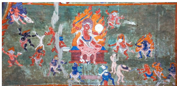
Fig. 13. Inscriptions on the slate of the monkey-headed assistant: ‘letter of white and black deeds’. Below: Yama, ‘the Dharmaraja, Lord of Death, sees the white and black deeds in his mirror’. Below: ‘the inborn god and demon assemble white and black pebbles’ (Appendix, inscription 7).

Then one's own visions will assume the appearance of the Dharmaraja Yama, the Lord of Death, 17 flanked by a white god and a black demon, each exposing a heap of small pebbles, white or black according to the good or bad deeds committed by the deceased.