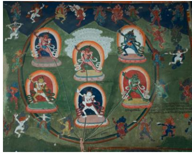
Fig. 7. The inscription (see Appendix, inscription 4) reads: ‘On the seventh day from the pure land of Khechara, the Vidyadhara deities come to meet [the deceased]. From the Vidyadharas appear the five consorts and around them, a numberless assembly of dakinis appears: those from the cemeteries, those of the four families, those of the three places, those of the twenty-four sacred places, along with male and female warriors, protectors and guardians.’ Each Vidyadhara is identified by an inscription: rNam par smin pa’i rig ‘dzin , Sa la gnas pa’i rig ‘dzin , Tshe la dbang ba’i rig ‘dzin , Phyag rgya chen po’i rig ‘dzin , Lhun gyis grub pa’i rig ‘dzin . A five-coloured light of co-emergent pristine cognition ( Lhan cig skyes pa’i ye shes ) emanates from the heart of each Vidyadhara and reaches the heart of the deceased, together with the green dull light of the animal realm ( dud ‘gro’i ‘od ljang-khu ).

After the visions of these peaceful deities, there follows a series of more terrifying experiences of wrathful deities. On the mural we now have to go to the second row of paintings, starting from the viewer’s left.