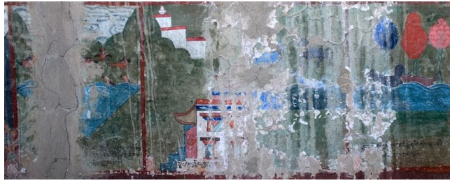
Fig.16. Image of the four continents. This portion of the paintings is badly damaged.

Then there will be appearances of the five realms he should avoid: nice houses and temples for the gods' realm, a pleasant forest and wheels of light for the demi-gods' realm, rocky caverns, crevices and straw sheds wrapped in dense fog for the animals' realm, tree stumps, black protruding silhouettes, blind desolate gorges or total darkness for the hungry ghosts' realm, and a land of darkness with red and black cubes, black earth pits and black roads for the hell dwellers' realms. The text in the inscriptions advises him not to enter there.