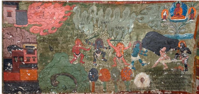
Fig.18. The inscription for the last image is as follows (Appendix, inscription 11): ‘If one is to take rebirth in an impure place, one will perceive a good smell from impure [objects] and, being attached to that, one will take birth. Therefore one should abandon attraction and aversion towards whichever appearance arises, and one should enter [a womb/a place] thinking: ‘May I assume the body of a fortunate person capable of benefiting all sentient beings.’ Ordinary beings who are not able to remain free from attachment and aversion in this way should call the Three Rare and Precious ones by name and take refuge in them and pray to the Great Compassionate One. Then they should enter the blue light of the human [realm], the white light of the gods’ [realm], nice houses and the like.’

Having thus avoided an unfavourable rebirth, in the end the moment will come in which one can no longer delay rebirth. The inscription on the mural gives a few instructions: avoid attachment and aversion, and pray to be able to take a new birth that will be beneficial to others. If that is not possible, then pray to the Three Jewels or Chenrezik and, taking refuge in them, be born as a human or god.