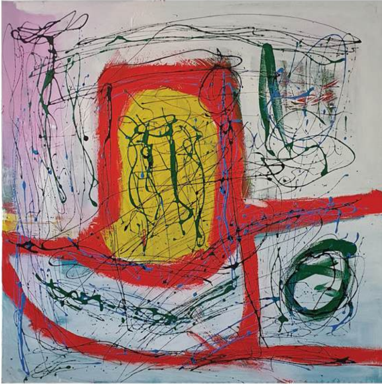
“ Sound waves 1 ” - 2023 - acrylic on canvas - cm 80x80