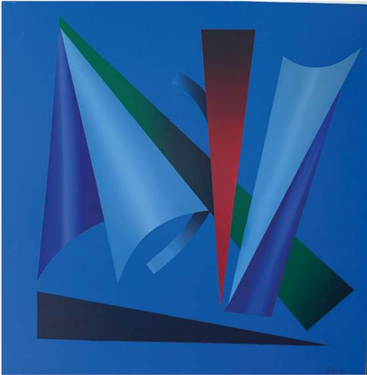
“ Palcoscenico ” - 2010 acrylic on canvas - cm 80x80