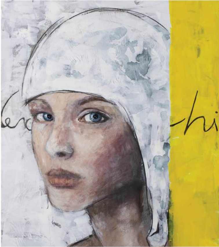
“we look for oxygen to breathe” - 2023

acrylic, pastels, graphite and resin on canvas - cm 100 x 120