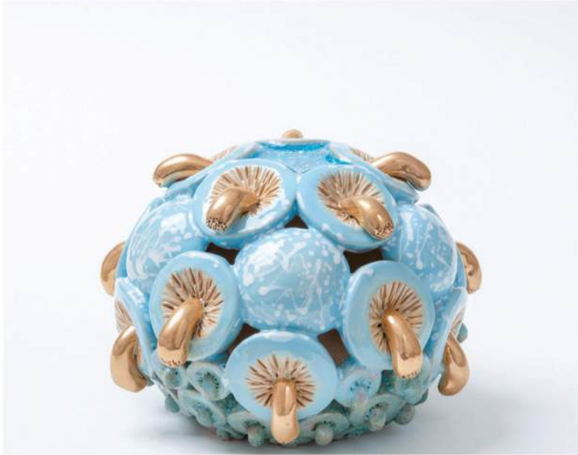
“ Mushroom Bom ” - 2022