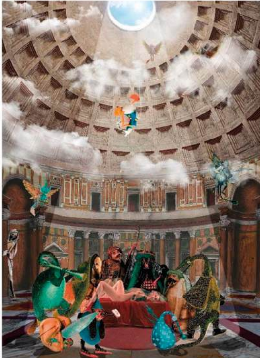
“ The endless girl ” - 2023

Mixed technique, airbrush, acrylic, tempera, pencils, markers, brushes, PC, Plotter, collage - cm 80 x 56