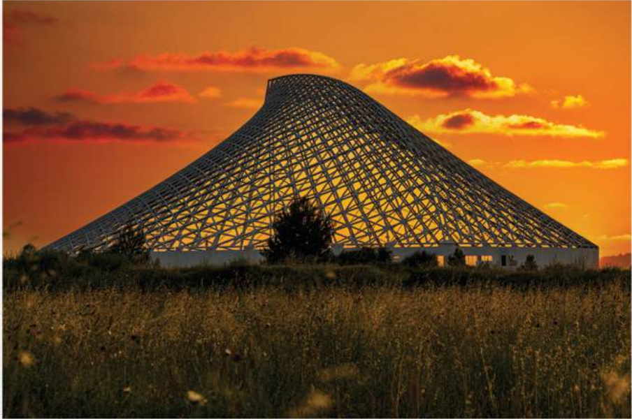
“ Sweet Sunset ” photo cm 50 x 70

He was born in Rome on January 8, 1961. He approaches photography in the school period, from there it is a progressive discovery and desire to know, following increasingly advanced photography courses, until he passes from a simple passion to a commissioned work. His themes range from urban architecture, seen in the early morning hours, to Food Photography, to portraiture. monogramma Gallery: