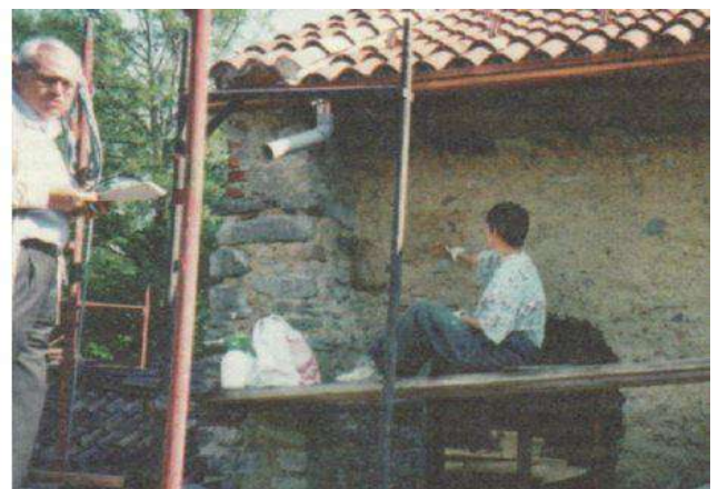
(Detail of the cleaning and consolidation phases of the plaster)