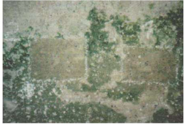
(Photo of restoration from the biological attack of the plaster with "Japanese paper")

Inside the church there are precious and ancient pictorial cycle that narrates the life of Mary according to the apocryphal oriental Gospels: these are paintings made with lime colours, on a trace drawn on the mortar.