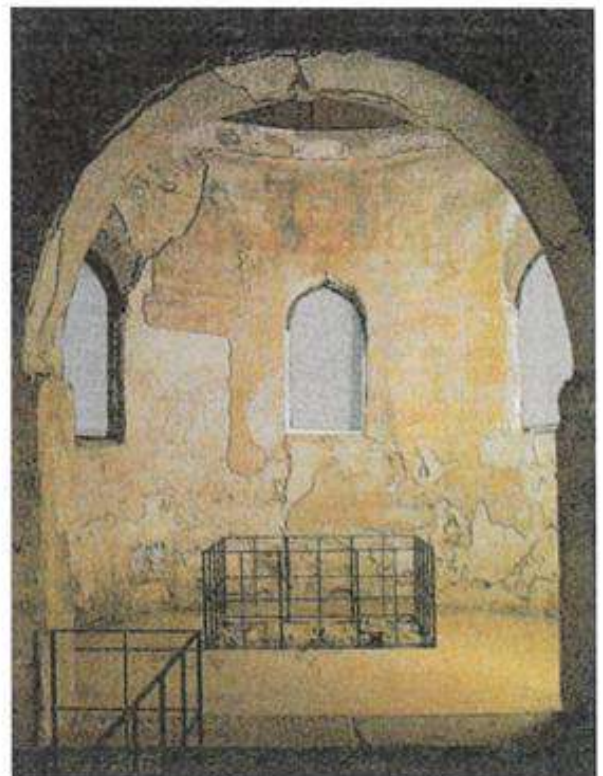
(External and internal view of the Apse)