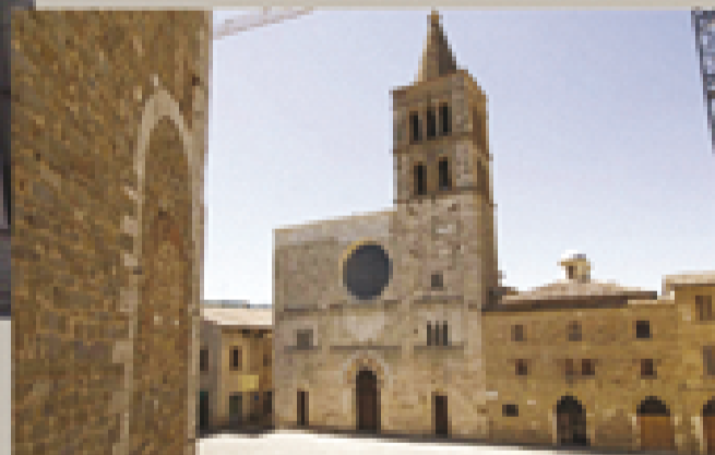
St. Michael Church, Bevagna

2) "Pro.Mu. Restauri s.r.l.", Viterbo - 2016 Project Architect