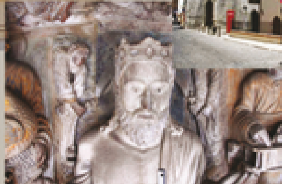
Portico de la Gloria, Cathedral of Santiago de Compostela, Spain