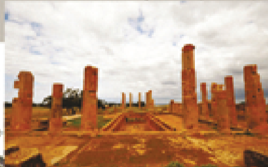
Archaeological site in Ptolemais, Libya