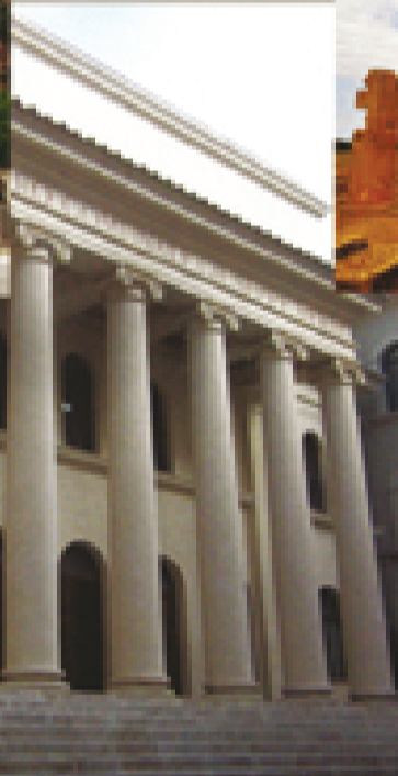
Verdi Municipal Theatre, Terni