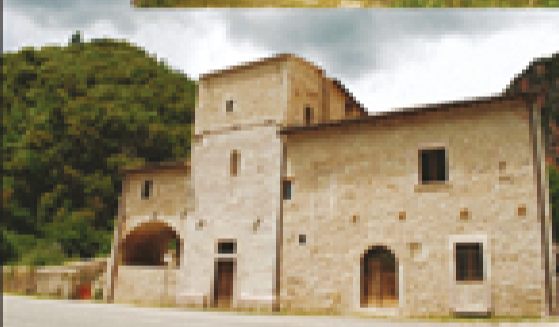
St. Mary de Ugonis Church, Vallo di Nera