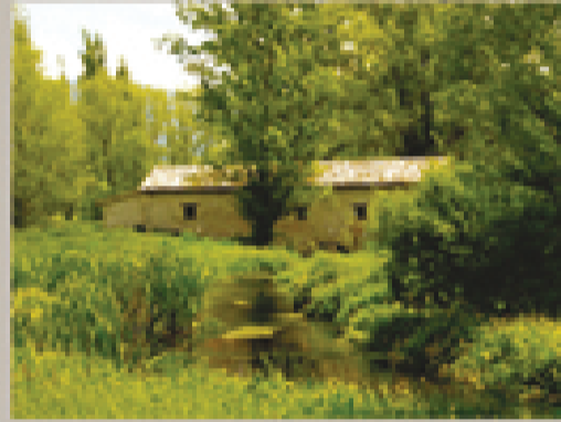
Monti Sibillini National Park