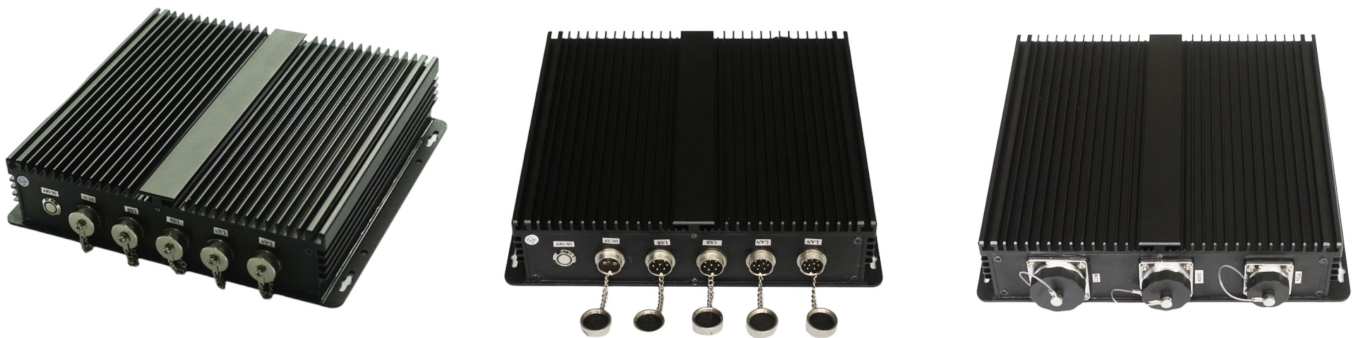
The actual appearance is subject to the final configuration.