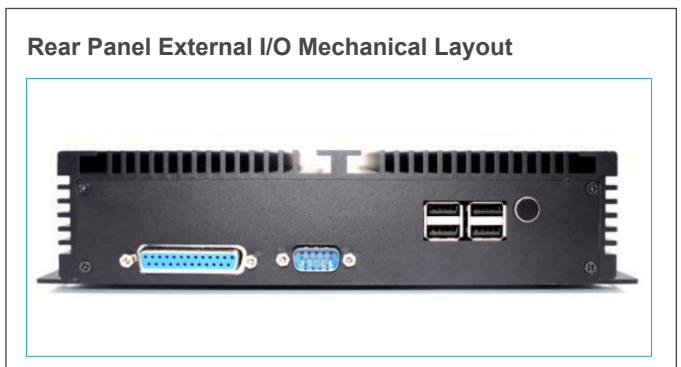
The actual appearance and dimensions are subject to the final configuration