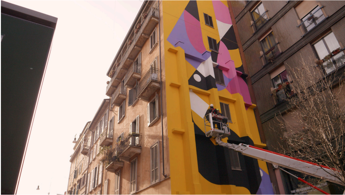
LUCA FONT X KIKO