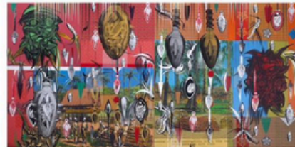
Zulkifli Yusoff, Hujan Lembing Di Pasir Salak

AFK: One of the most effective ways is through our method of collecting and documenting.